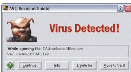
AVG Resident Shield does not allow you to open infected files and offers actions available to remove the virus

AVG Anti-Virus plus Firewall provides all of Grisoft's advanced virus detection methods and components, including heuristic analysis, generic detection, scanning, and integrity checking. The sophisticated AVG Anti-Virus testing engine at the heart of the solution uses an extensive preprocessing procedure to proactively scan data for patterns of virus code, which it disarms by rendering the code in its basic form.